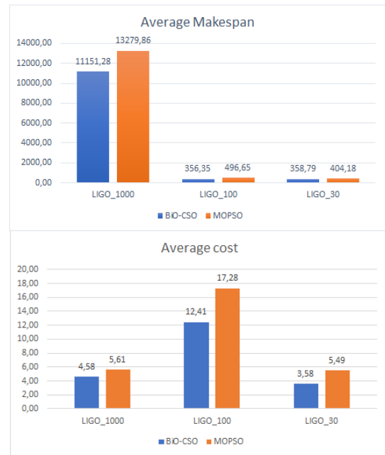
Figure 3: Cost and makespan average values obtained by BiO-CSO and MOPSO for LIGO workflow

The table 5 illustrates the average values for computation and data transfer time obtained by BiO-CSO and MOPSO for the LIGO workflow with 30, 100 and 1000 tasks. It shows that our algorithm BiO-CSO achieves better average values than MOPSO for all the LIGO workflow scales with a gain ranging from 11% to 28%. For example, for the LIGO_1000, the BiO-CSO data transfer time is 16% better the the MOPSO one. It can be seen also that the data transfer time represents roughly 75% of the workflow execu-